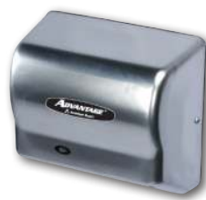
Steel Satin Chrome