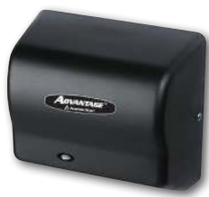
Steel Black Graphite