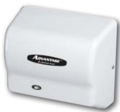
Steel White Epoxy