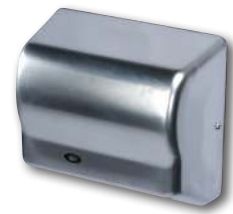
Steel Satin Chrome